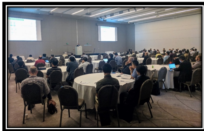
Attendees at the 16 th ASME ICNMM, 2018 in Dubrovnik, Croatia